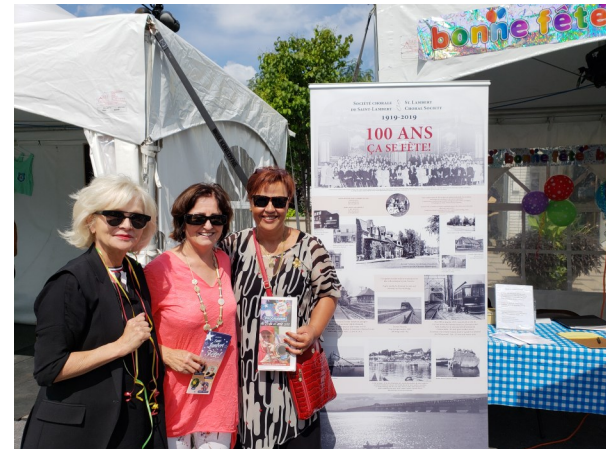
Congratulations to the St. Lambert Choral Society, which is celebrating its 100th anniversary!