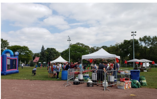
A beautiful day at the Saint-Lambert Seaway Park