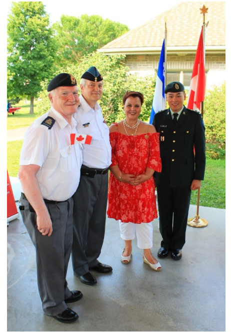
Royal Canadian Legion of Brossard--Branch 215 and...