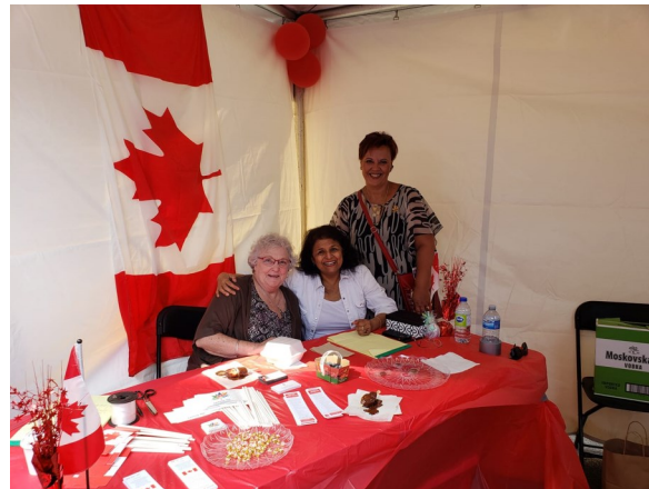
Happy to attend the celebrations