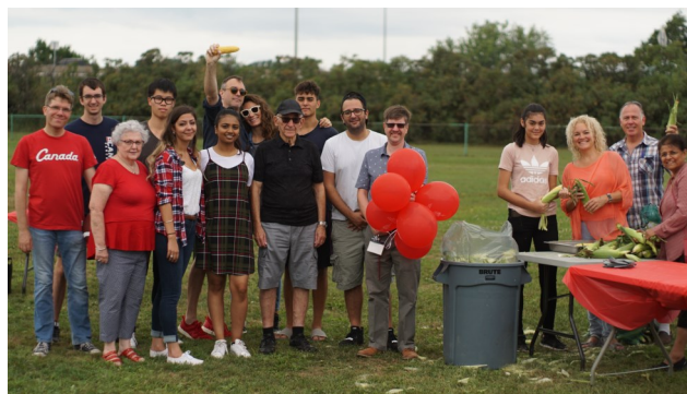
Thank you to our amazing volunteers!