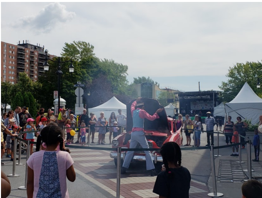
Entertainment for all ages!