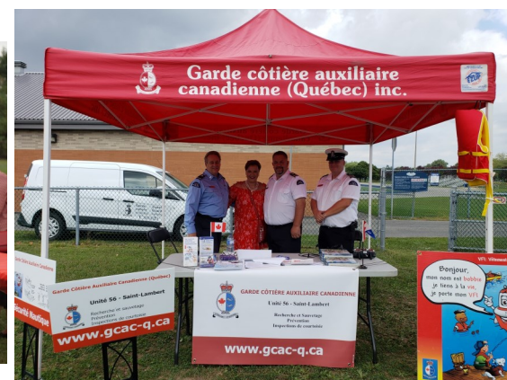
Thank you to our friends of the Canadian Coast Guard Auxiliary - Unit 56 - Saint- Lambert for their annual participation